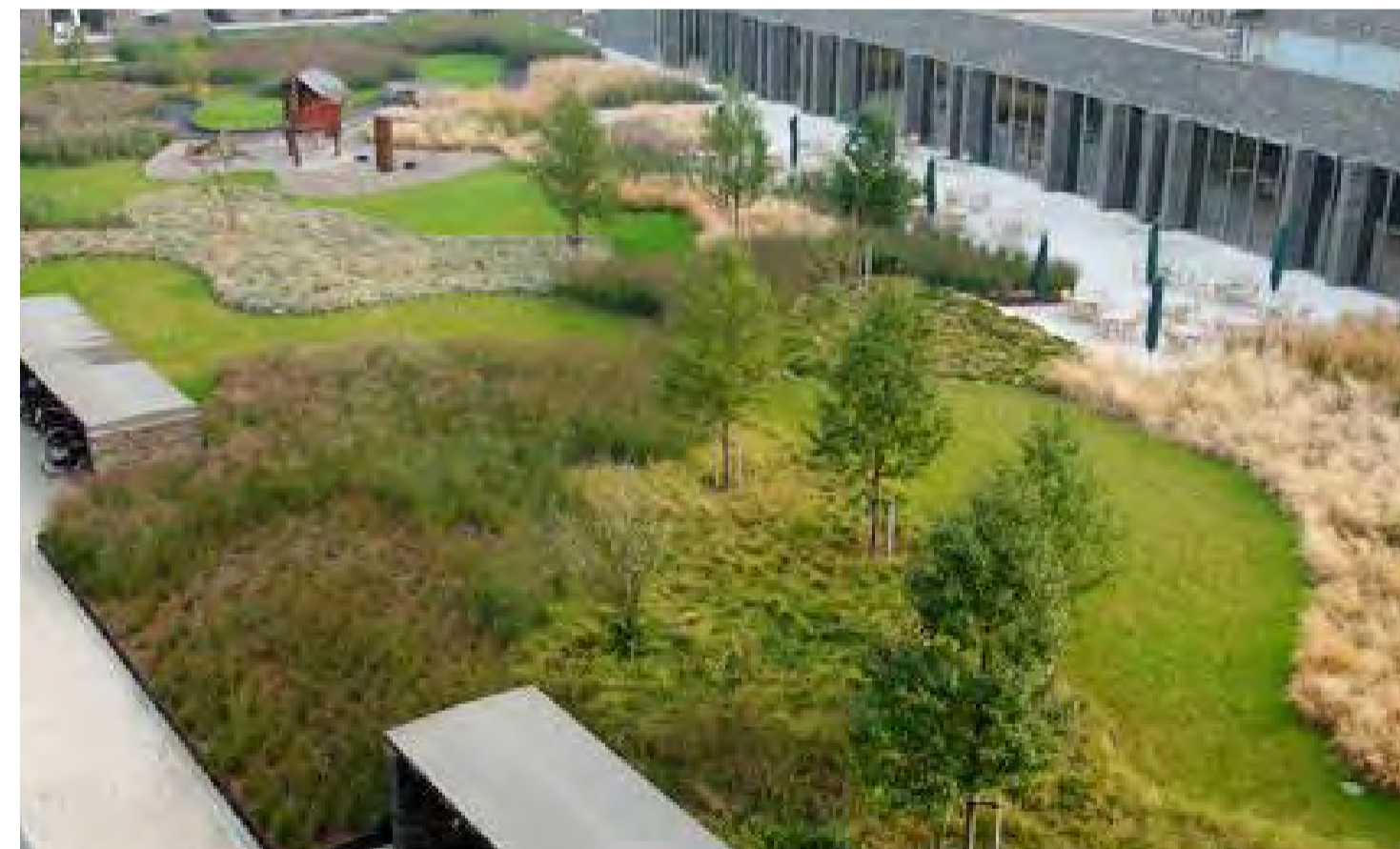
Intermingled garden planting precedent (Charlottetown, Copenhagen)