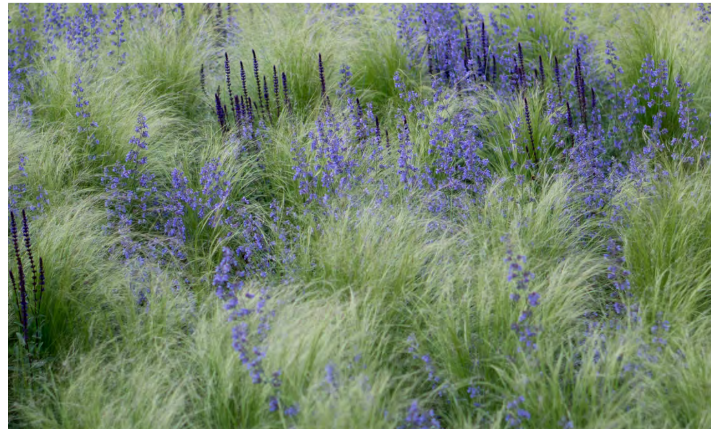
'Grassy' perennials mix