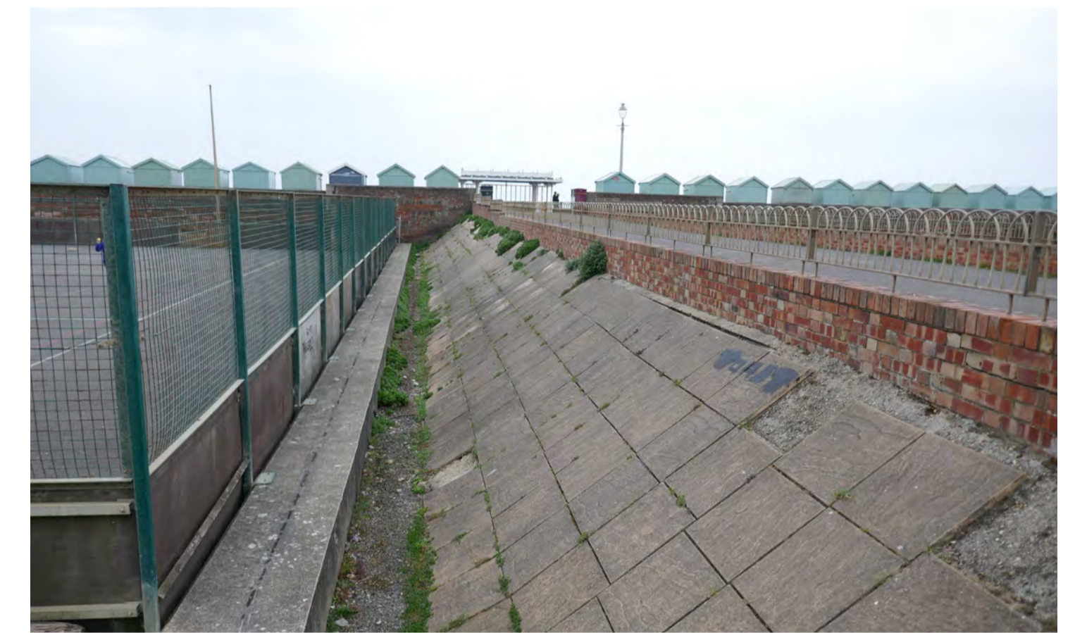
Existing MUGA facility contributes to inaccessibility of the site