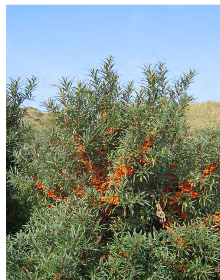
Sea Buckthorn (berries for birds)