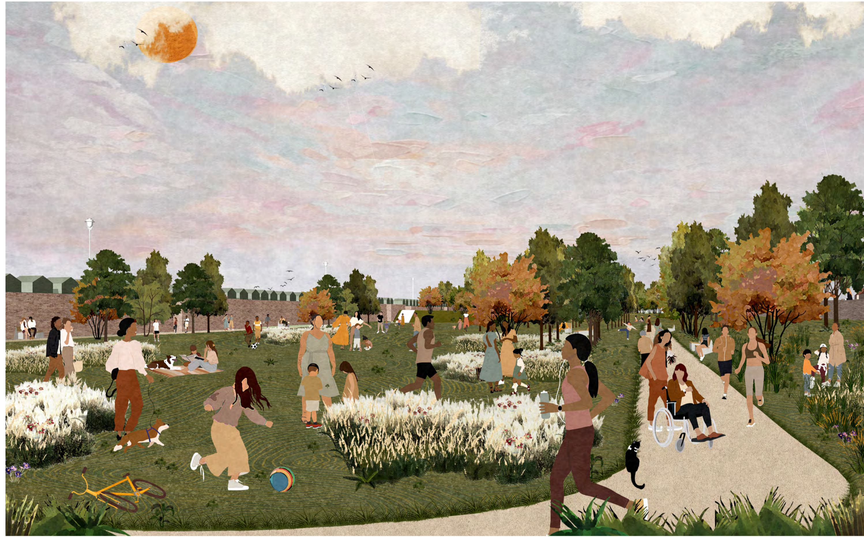
Artist's impression, view looking west across new Park Garden space, showing planting including meadow grasses to lawn, perennials to embankments, and trees