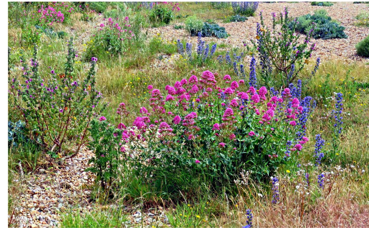
Perennials (Shoreham Beach)