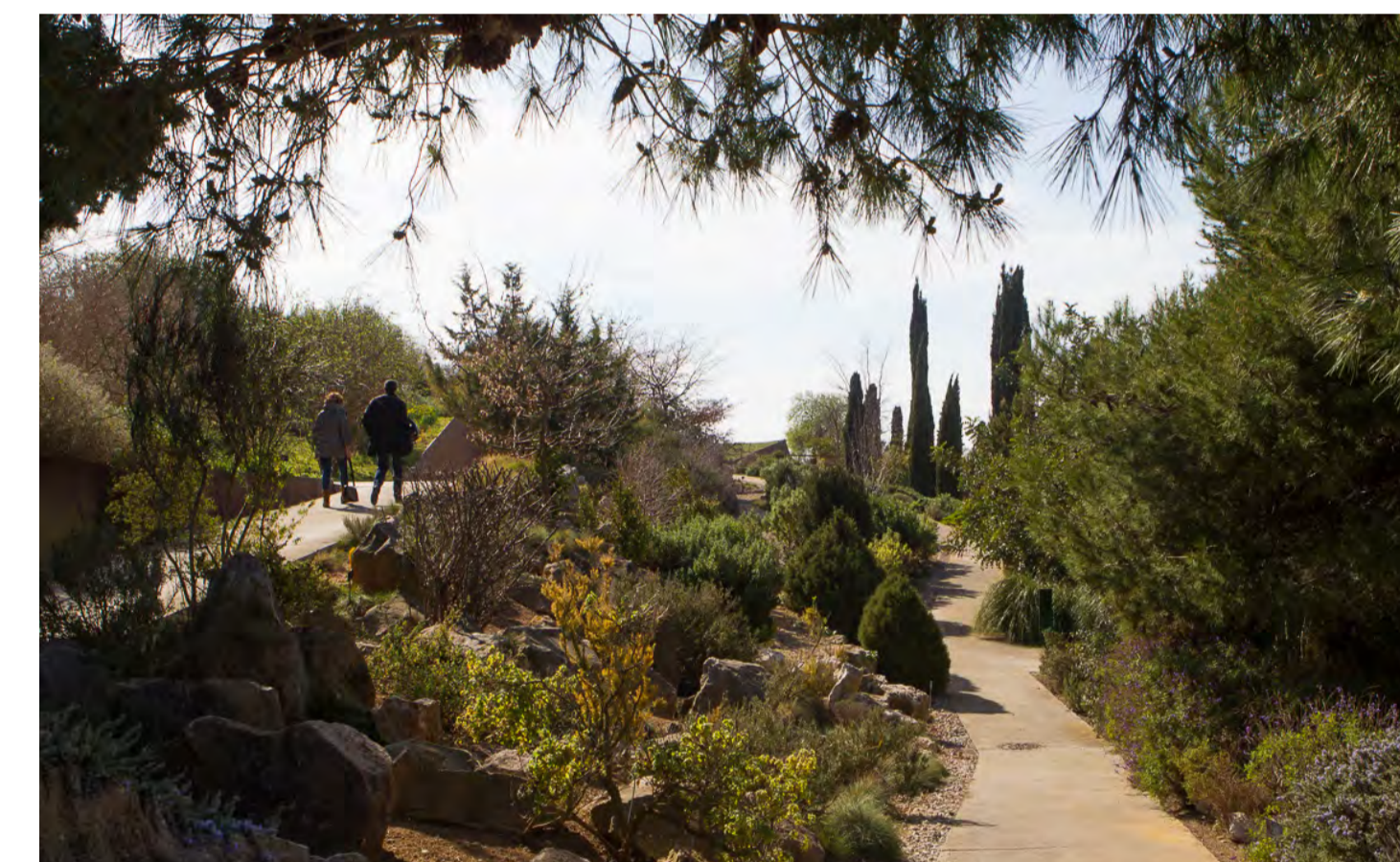
Planted embankment precedent (Botanic Gardens, Barcelona)