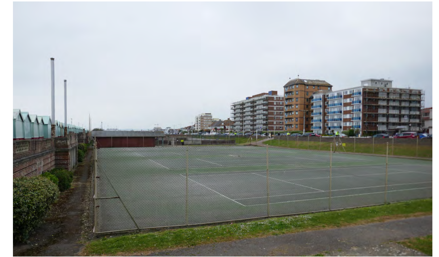
Existing western Tennis Courts area, showing accessibility issues