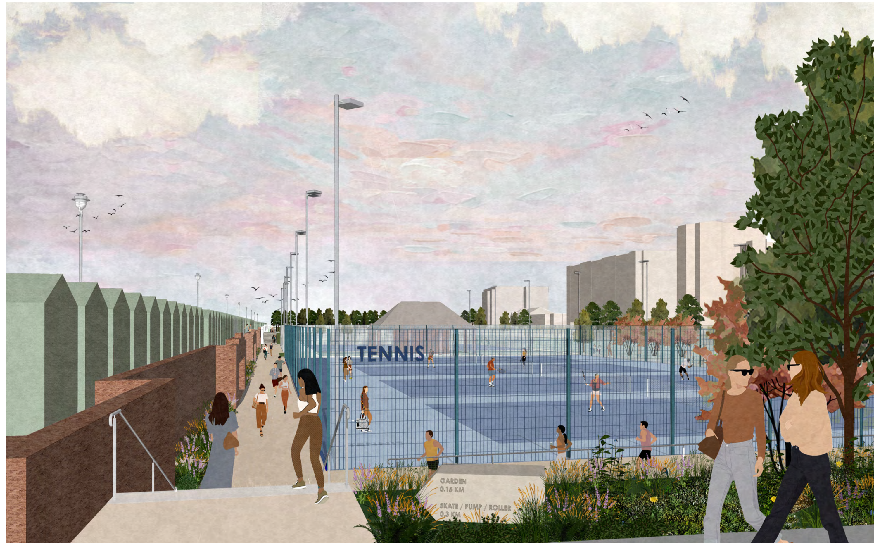
Artist's impression, view from east showing new Tennis Courts and the new accessible route through the Linear Park