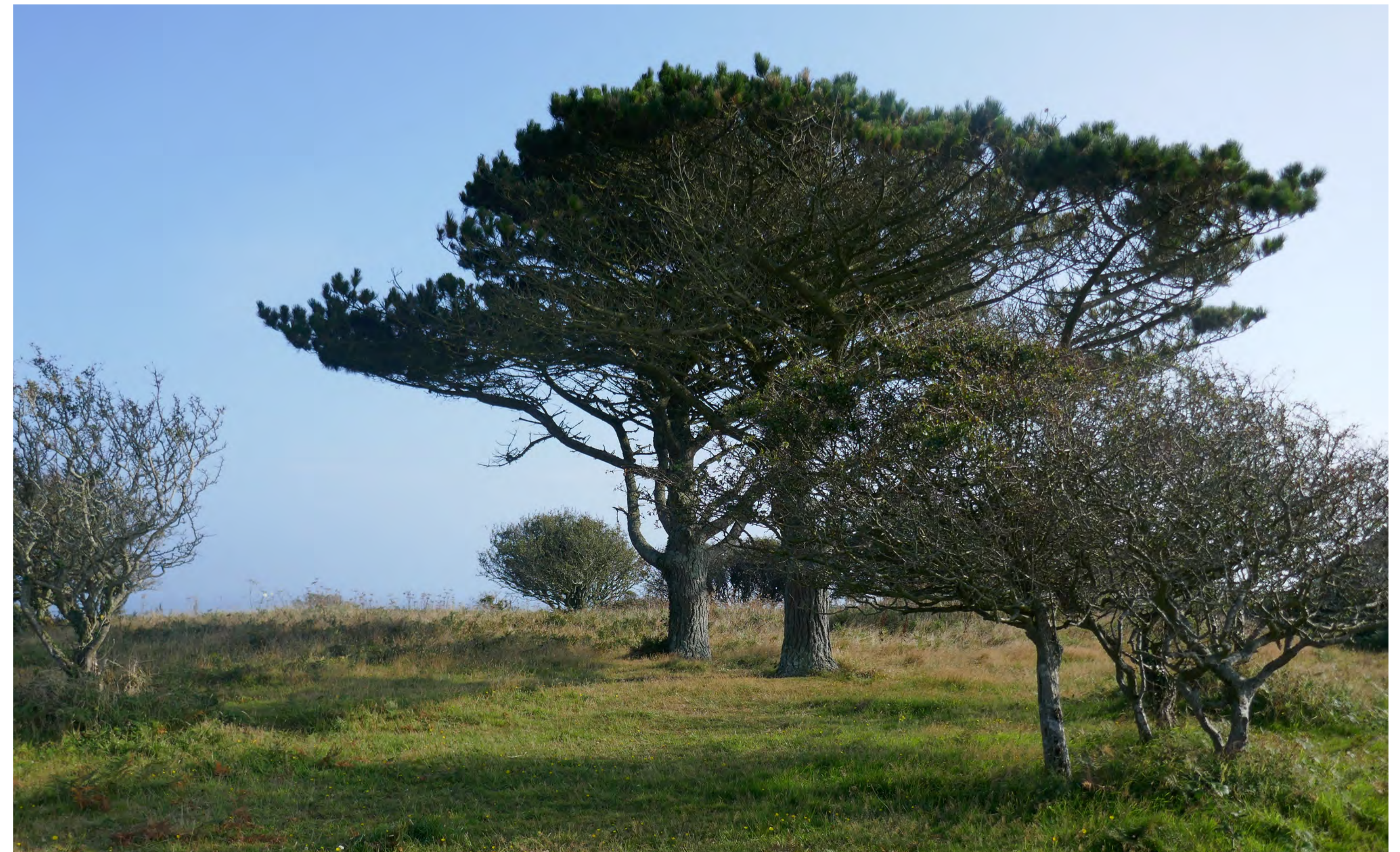
Coastal pine and hawthorn, demonstrating character of planting shaped by the wind (Dodman Point, Cornwall)