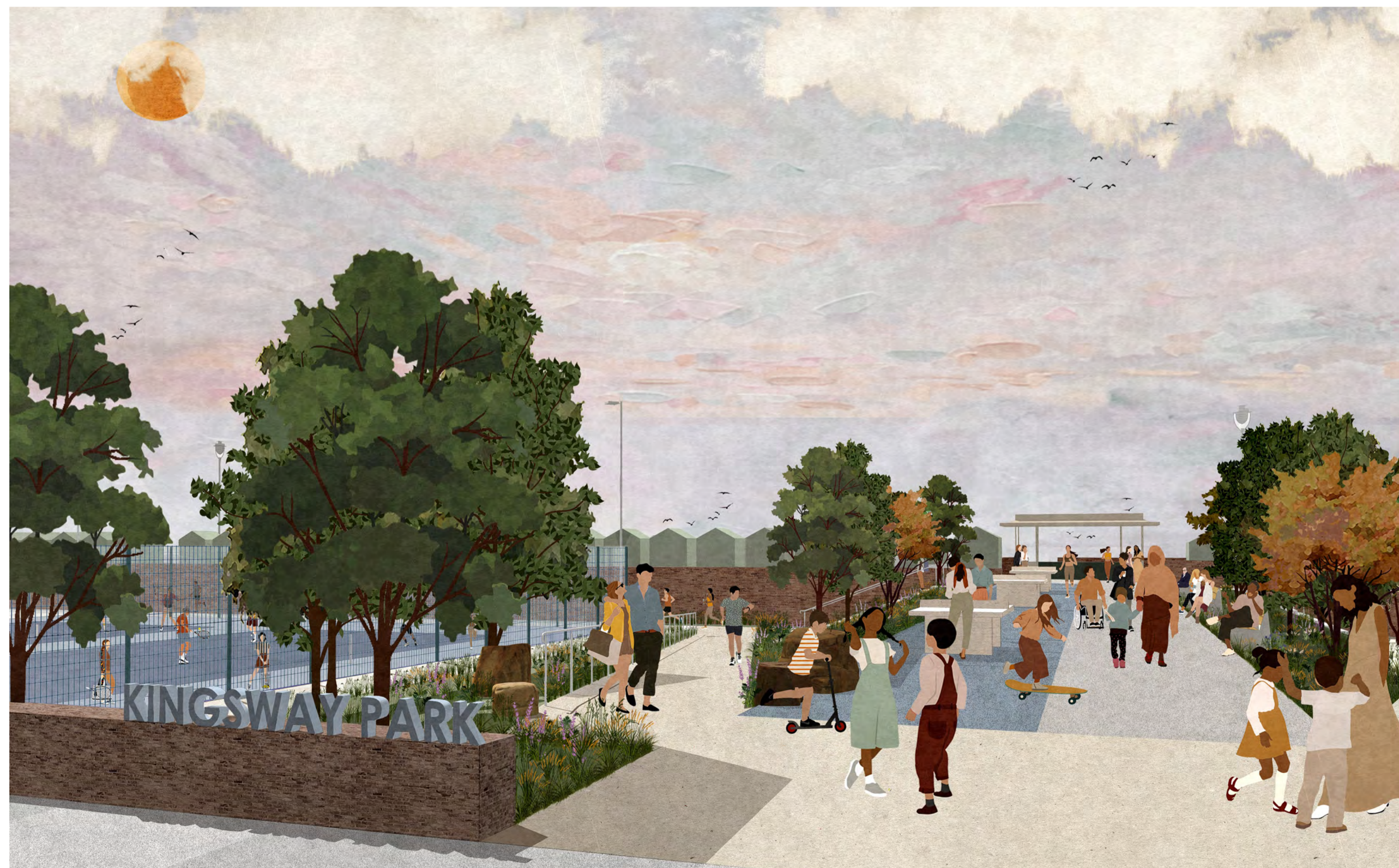
Artist's impression, view from north at Kingsway looking towards the Esplanade, showing park entrance with new amenities and ramped incline towards Tennis area