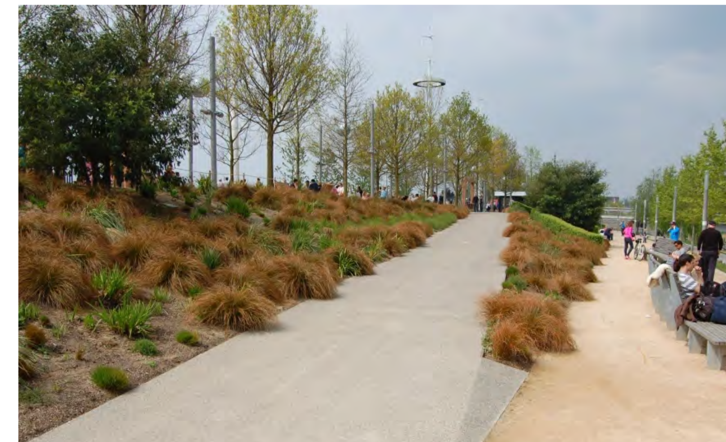
Planted embankment precedent (Queen Elizabeth Olympic Park, London)