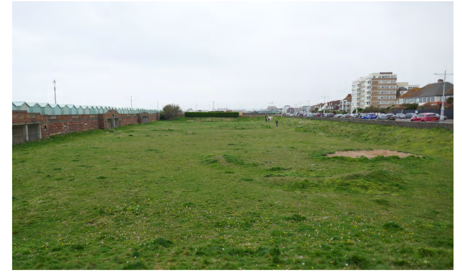
Existing bare amenity lawn of old Pitch & Putt space